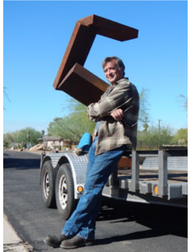
Right before The Runner was installed.