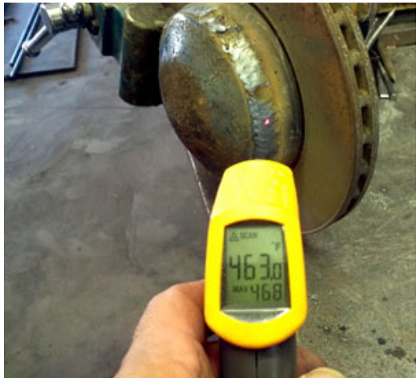
It's already warm at Kevin's studio in Phoenix