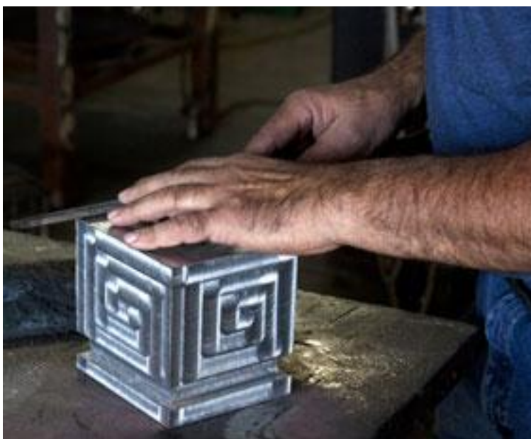
Kevin works on an aluminum block.