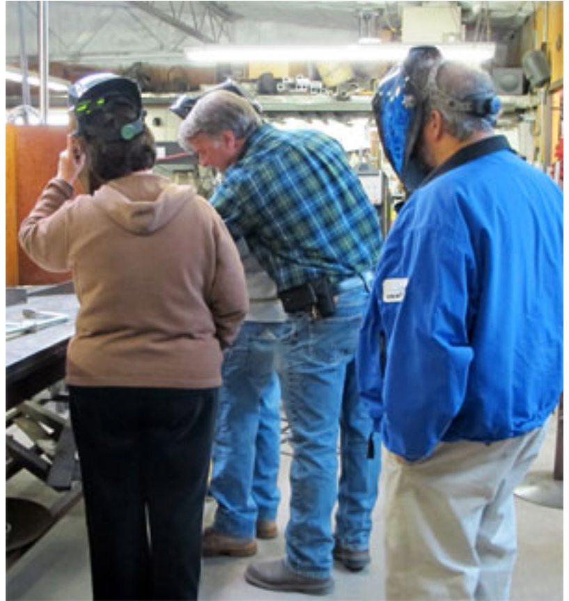
Welding instruction for members of the Arizona Artists Guild Sculpture Group