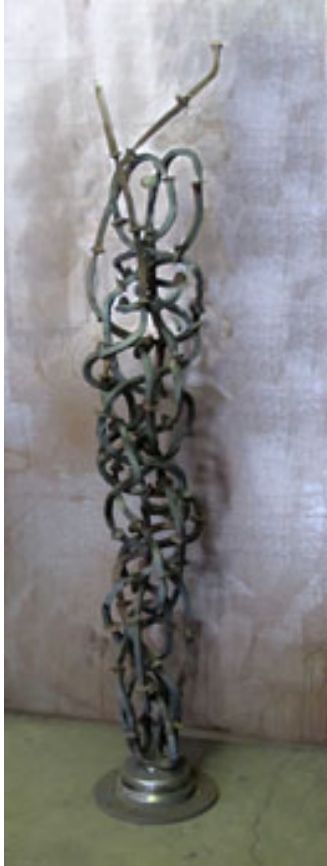
This spike sculpture continues to grow

continues to work on several sculptures in the studio.