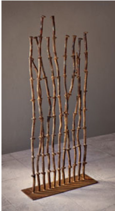
Railwort, a fine art sculpture