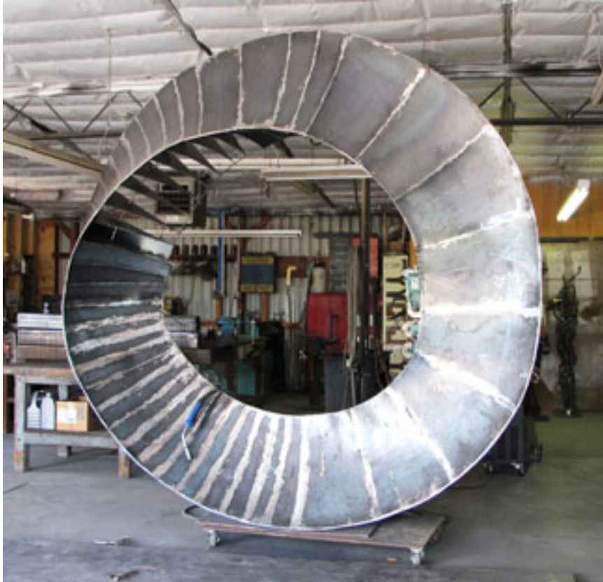
Wherever You Go, with 26 panels (and patina) to go

held Monday, November 19 to Friday, January 18 at the University Club. The opening reception is Thursday, November 29, 5:30 - 7:30 p.m.