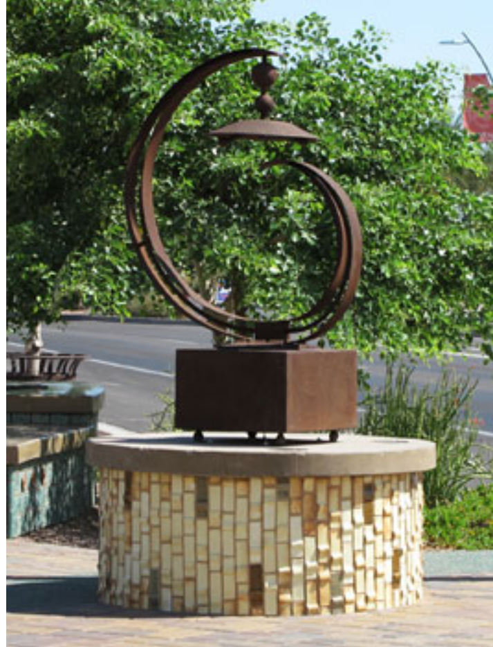
C-note, installed at Arizona and Buffalo in Chandler, Arizona

Despite temperatures regularly over 100 degrees, Kevin