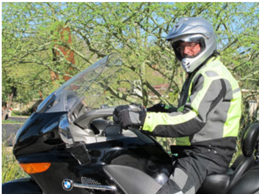
Ready to ride