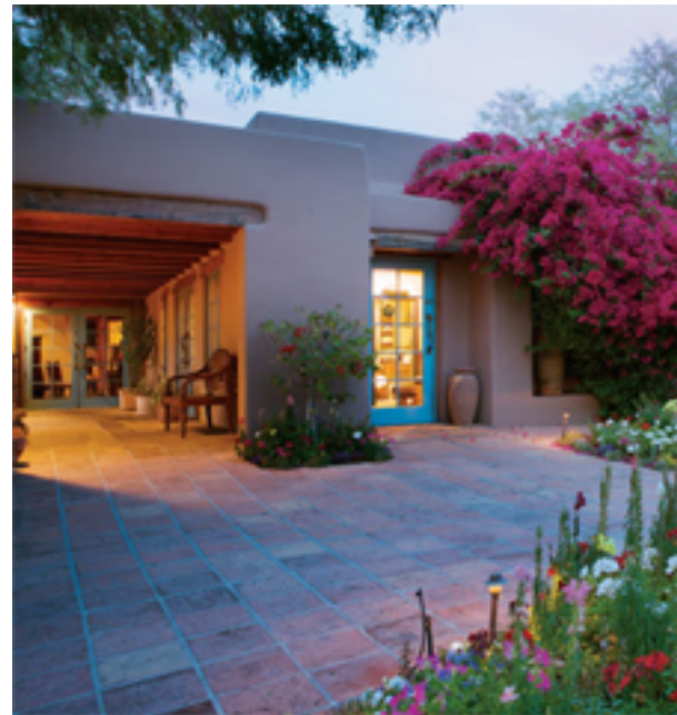
LON's at the Hermosa