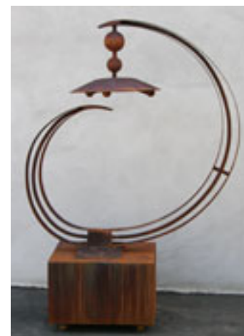
C-note, a chime introduced at the Kid at Heart show