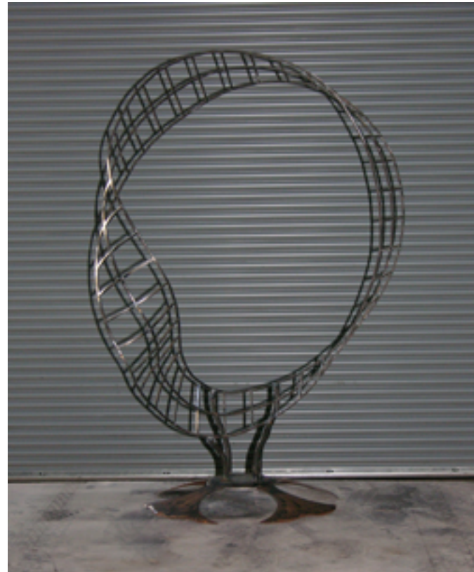
Untitled cousin of Mobilus in process