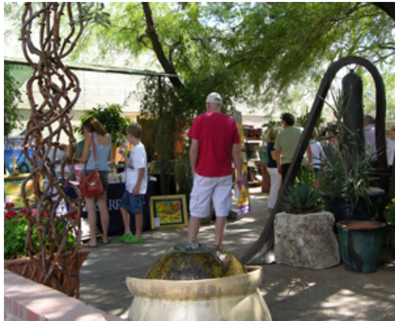
Saturday at Magic on Main provided more time for visiting and viewing