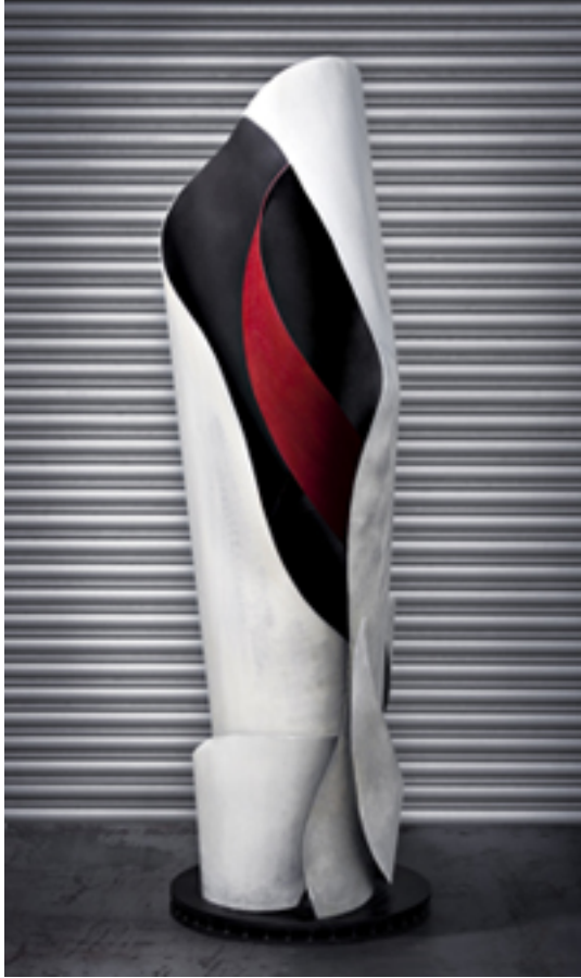
Sanctuary debuted at Magic on Main