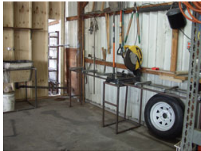
Kevin Caron's cut-off table (for a larger image, visit the Studio Photo Gallery by clicking on the photo)

BCT (that's "Before Cut-off Table"), Kevin had to bring out the chop saw and clamp it to the work table each time he wanted to use it. Then he'd bring his metal in from its outside storage area and lug it to the work table in the middle of the studio. (Visit the Studio Photo Gallery to see a close up of the cutting table and the rest of the studio.)