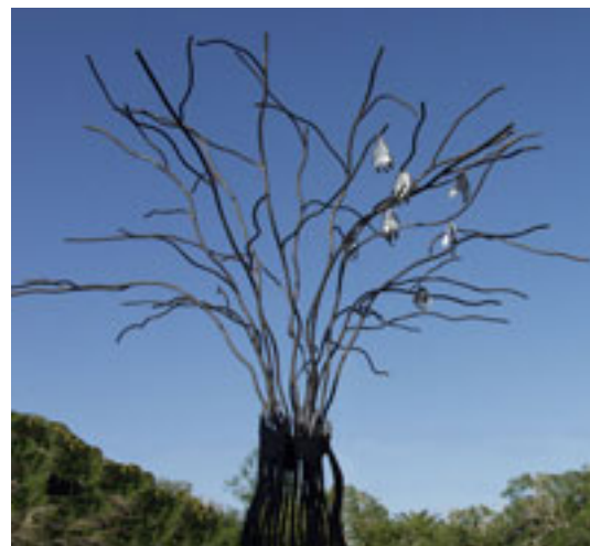
Hands On, in process, with a few "hand" leaves before powder coating

You can see each step of the process of creating this 14-foot-tall tree with its 14-foot-wide crown in Kevin's new Photo Gallery on the Web site as well in some of the recent videos .