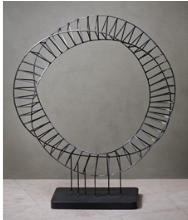
Skeletorus, before its patina