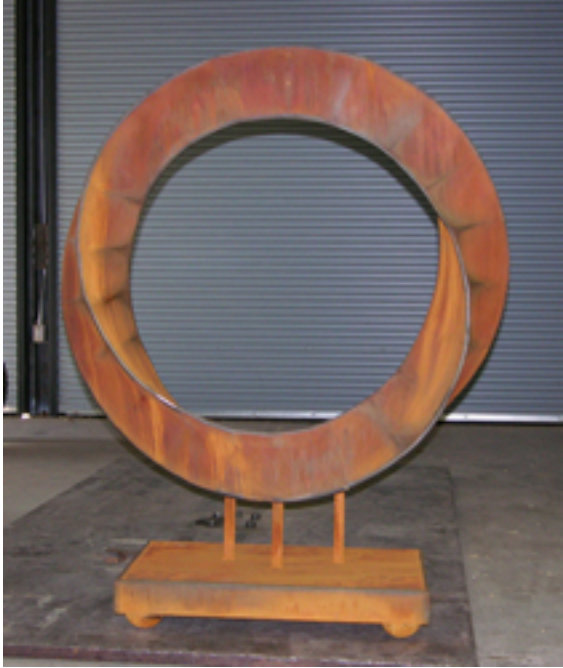
Torrent, still under way

a larger photo of Torrent on its own page .