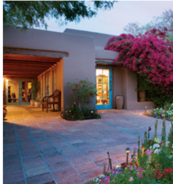
LON's at the Hermosa

Also plan to attend Magic on Main , a celebration of Pearson & Company's 20th year on Main Street on Scottsdale's Gallery Row. The show opens on Thursday, October 20, from 7 - 9 p.m., and there's an encore on Saturday, October 22, from 10 a.m. - noon.