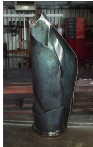
Sanctuary, before its patina

Keep an eye on Kevin's Web site to see it develop .