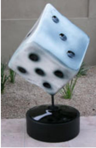
Loaded, a kinetic sculpture