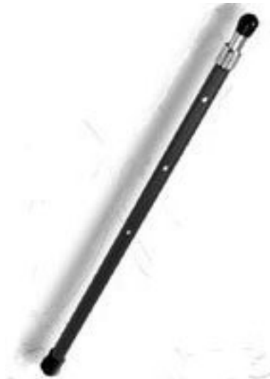
A hood holder

If you'd like to know more about a specific tool, let us know - we might have an answer. Email us at info@kevincaron.com