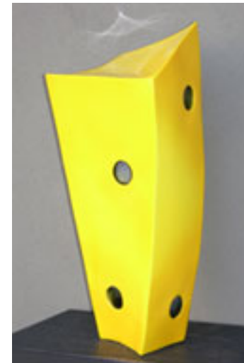
Wild Swiss to find a new home at the CF auction

For more information about the auction and Contemporary Forum, visit http://www.contemporaryforum.org