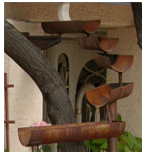
RainDrop, a functional sculpture

Click here to see photos and movies of RainDrop working.