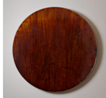
The wall sculpture Fall