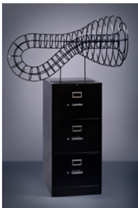
The Only Way Out