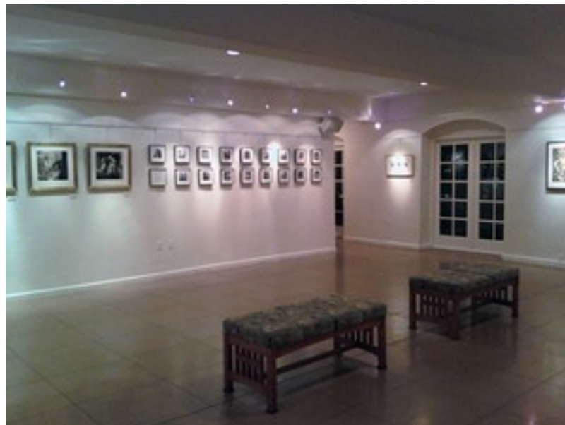
Olney Gallery in downtown Phoenix

The show will be held in the Olney Gallery in Trinity Cathedral, located in the heart of downtown Phoenix's arts district. It runs February 3rd - 27th. The first reception is February 3 (which coincides with Phoenix's First Friday street fair) and the second is February 17 (during Phoenix's Third Friday). Each gathering will be held from 6:00 - 9:30 p.m.