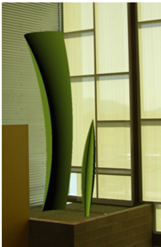
A rendering of The Seed