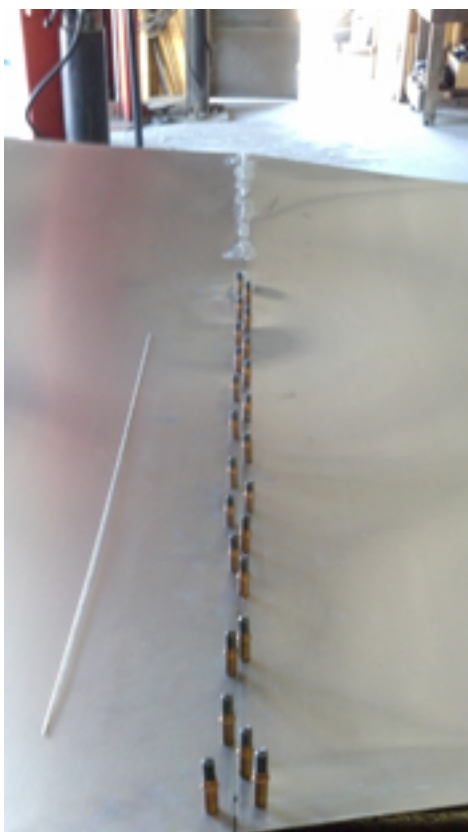
Two panels of The Seed held by cleco fasteners

If you're in the Valley, please mark your calendar now for one of these receptions. We look forward to seeing you there.