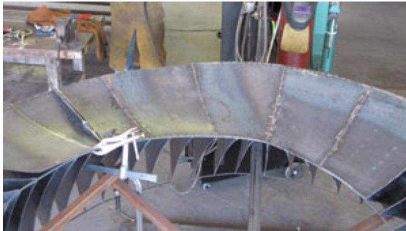
Sections of skin on Wherever You Go, There You Are

Also also under way at the studio is Wherever You Go, There You Are , which has been accepted for a juried public exhibition at Pima Community College East Campus in Tucson, Arizona.