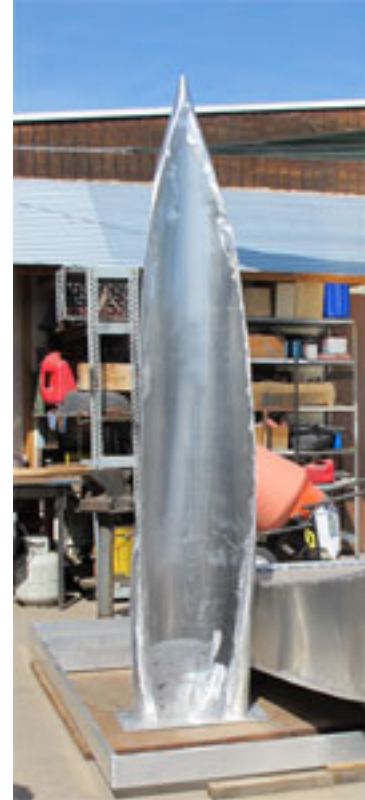
The 'kernel' of The Seed, standing

Click here to see how the sculpture will look and watch its progress.