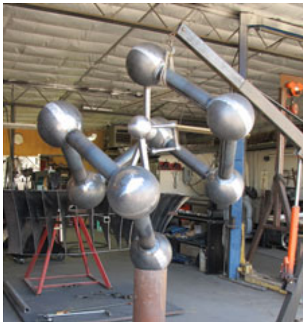
The beginnings of a new sculpture