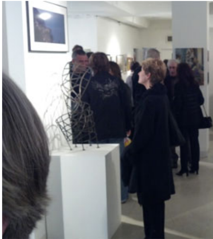
A visitor to the show in New York contemplates Cyclone

Thanks to everyone who attended the shows - Kevin appreciates your enthusiasm and support.